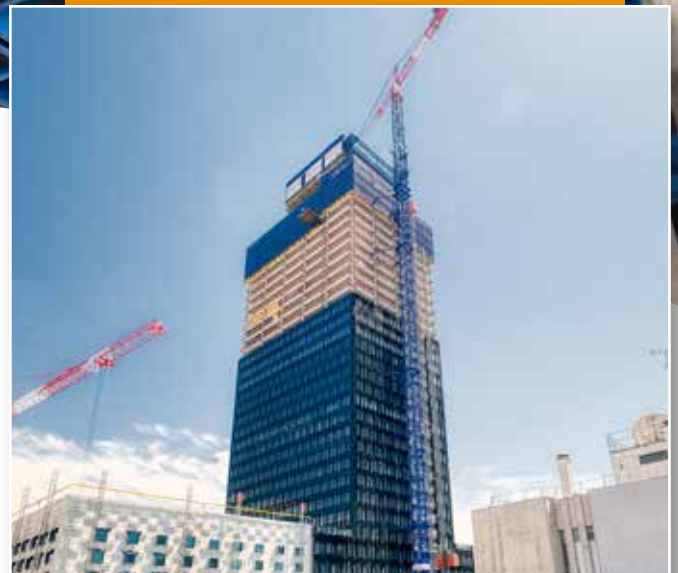
Work site: To-Lyon ■ Customer: Vinci ■ Place: Lyon